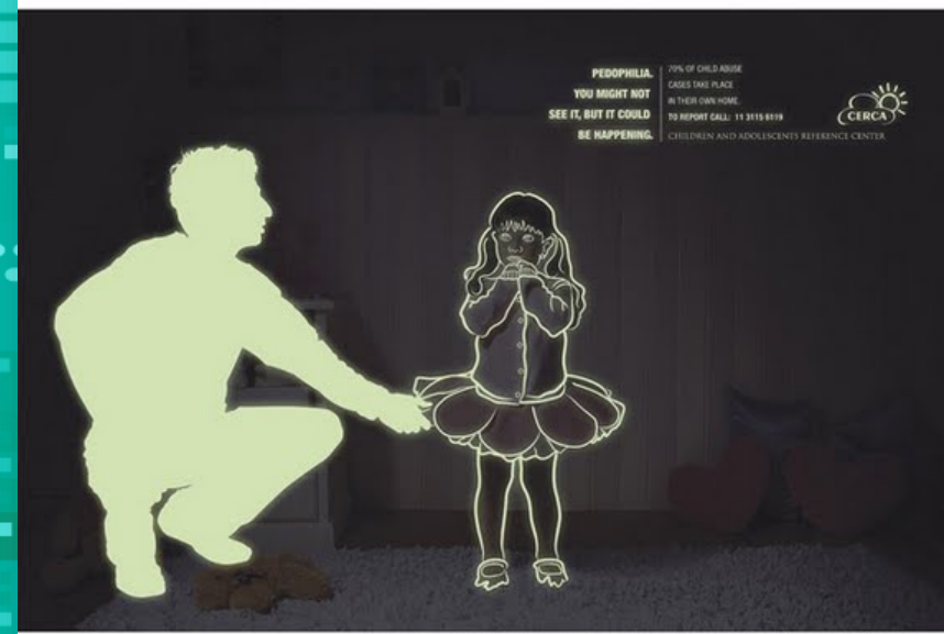
This is a simulation of how the poster is with the lights off: the glowing ink printed on the poster shines in the dark, showing this message.