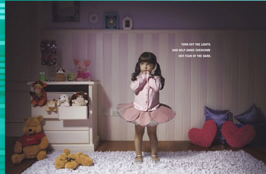
This is the original poster printed with fluorescent ink, which glows in the dark. This ad piece was located next to a light switch. With the lights on, you see the piece like this. When the lights are off, a new image will appear.