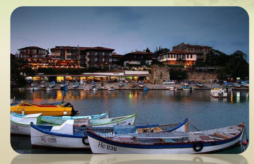
Old city of Nessebar