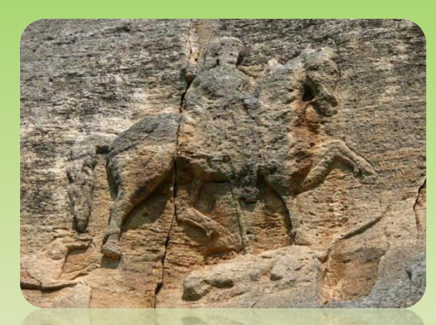
The Madara Rider